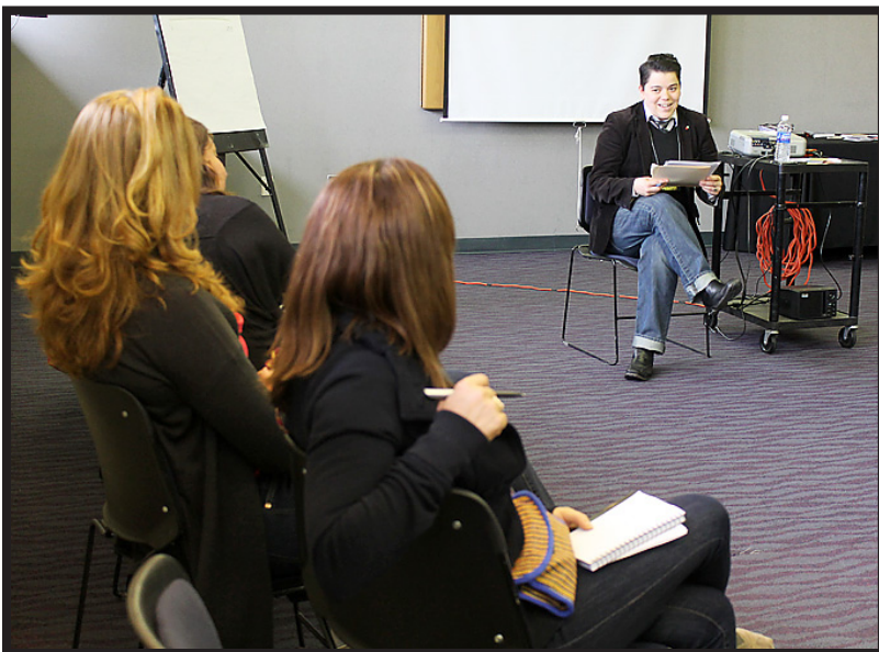
At Rutgers Sex Week in New Jersey, 2012

Sex is good for you. It is okay to want sex. There is nothing wrong with your sexual hungers, kinks, or desires. Repeat those sentences over and over until you believe them—or attend this workshop. Regardless of how good our sexual education or family’s openness has been in our lives, there is a huge degree of sexual shame that we have absorbed simply by being in western 21st century culture. How do we excavate it? How do we drop down into the depths of ourselves to uncover the myths that we believe so deeply to be truths in order to dig them up and plant new ideas of sex being inherently good, pleasurable, and worth pursuing? What kind of sex do you want in your life? How can you get more people to hit on you, become a better flirt, and negotiate with more ease? What do you need to become a sexual mathlete? We’ll explore all of that in this interactive workshop, where you’ll take away new paths of sexuality and pleasure to explore.